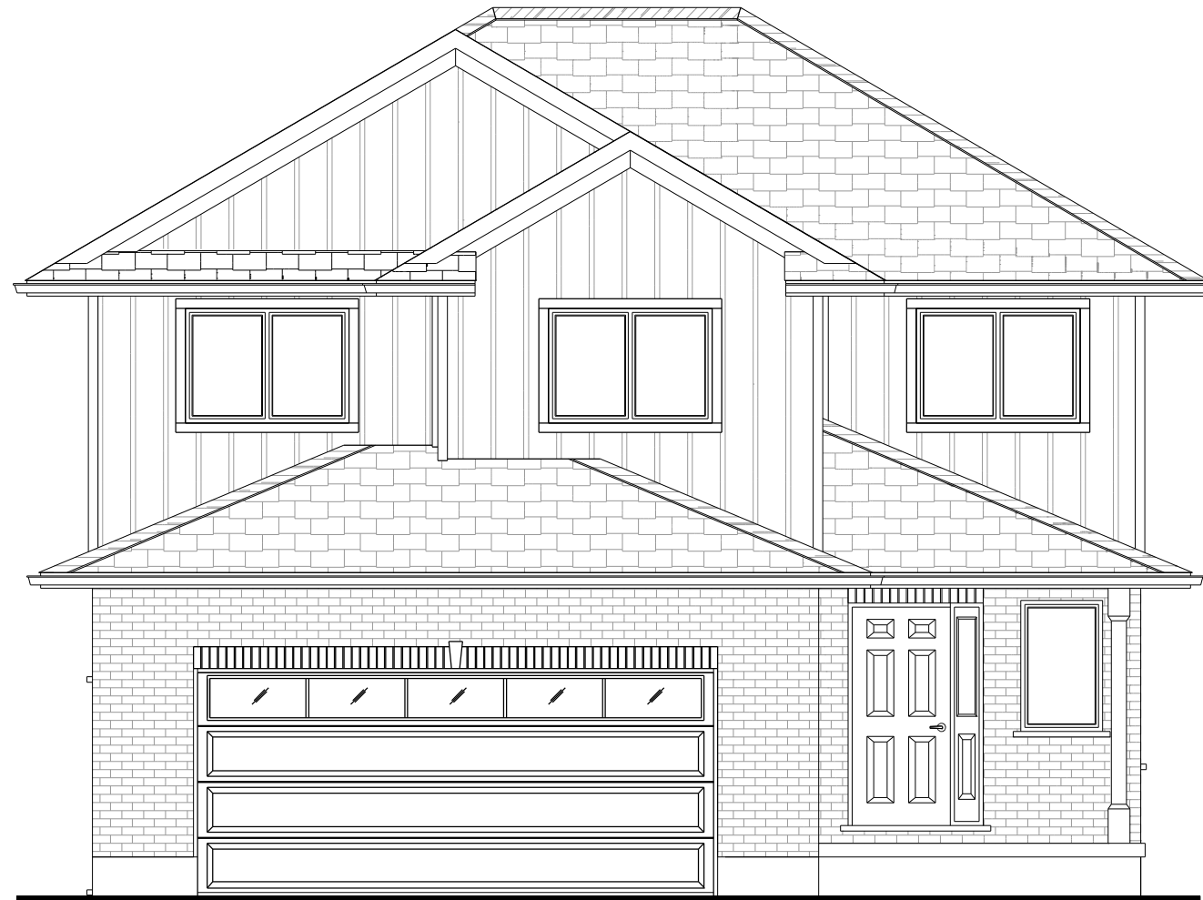
LOT 42 ASPEN PARKWAY