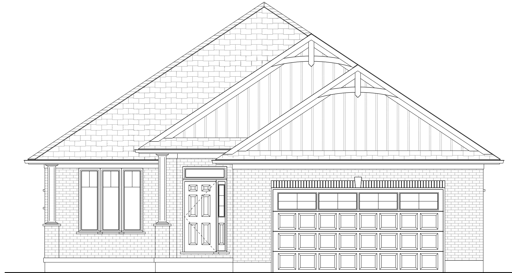
THE ROSSEAU II