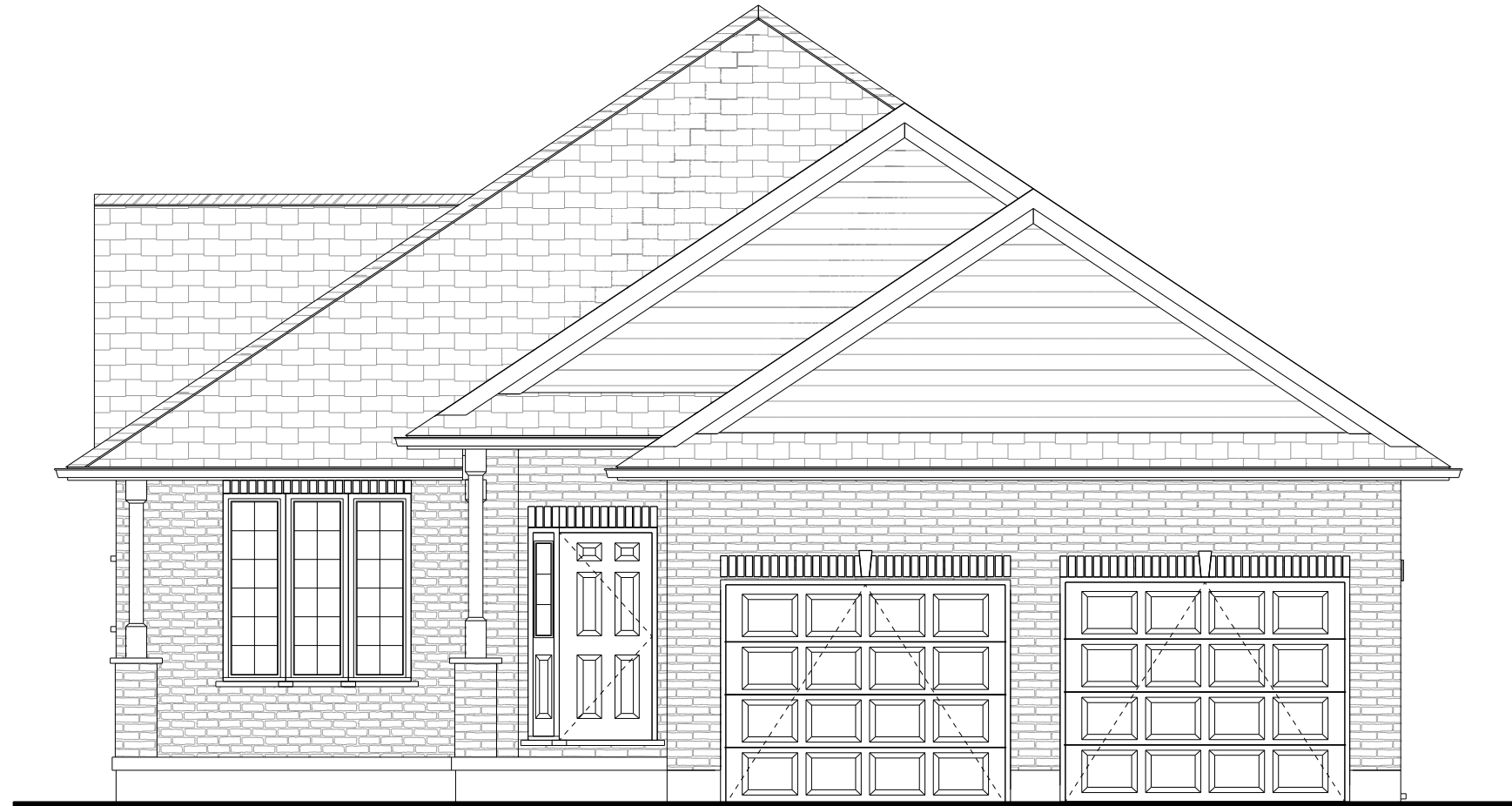
THE ROSSEAU III